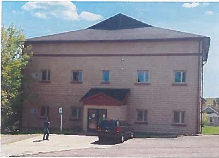
BACK OF BUILDING-EAST SIDE