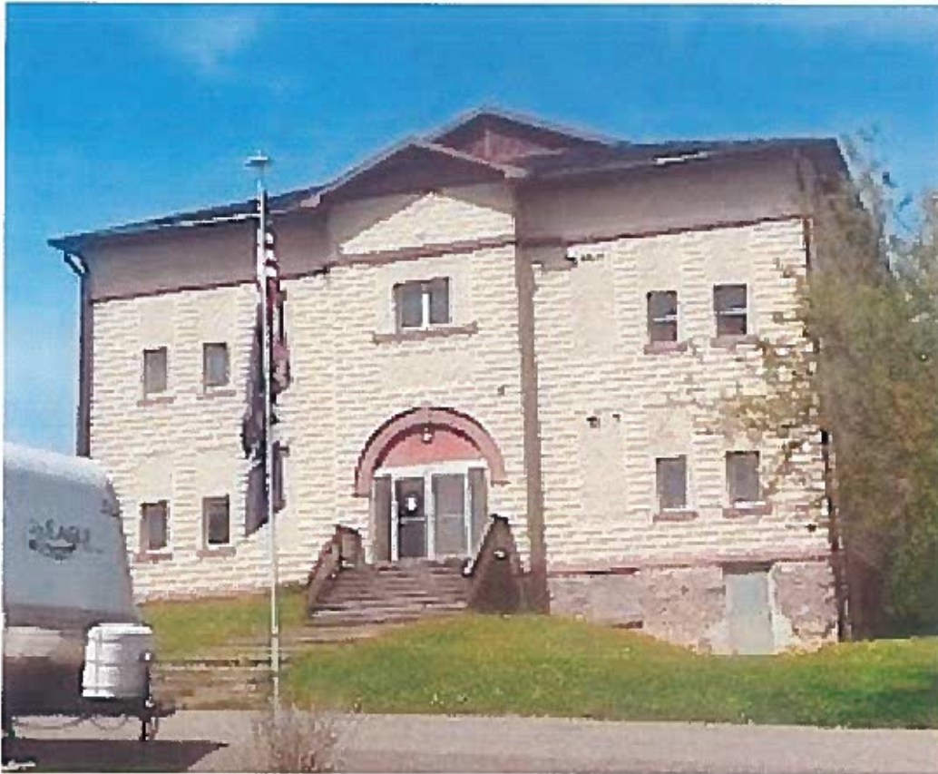
FRONT OF BUILDING-WEST SIDE

Bids are due by 2:00 p.m. on Wednesday, June 29 th , 2022 at the Ashland County Housing Authority Office, 124 Wilderness Drive, Mellen and will be opened at 2:05 a.m. on Wednesday, June 29 th , 2022.