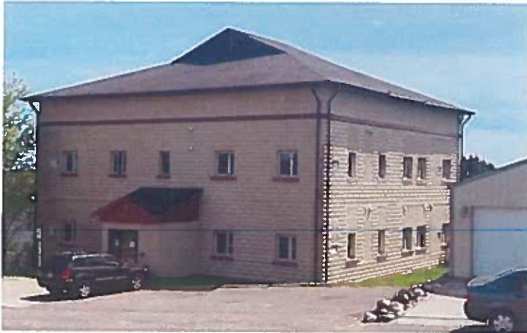
EAST and North SIDE OF BUILDING